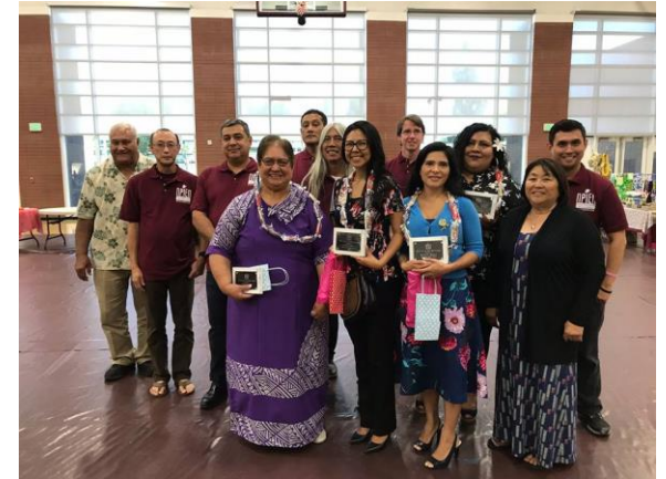
Top Educators receive Awards